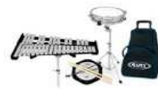
Drum and Bell

Any sixth grade student wishing to rent an instrument for band can go to this link: